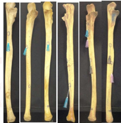
Fig. 4: Different positions and number of nutrient foramina in ulna.