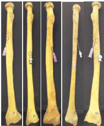
Fig. 3: Different position and number of nutrient foramina in radius.