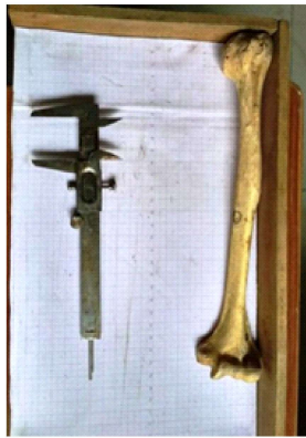
Fig. 1: Osteometry board and slide calliper used for measurement of different dimension of bones.